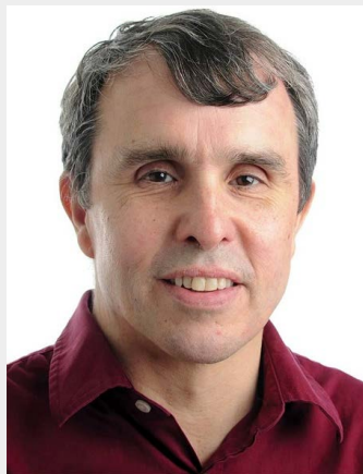
Eric Betzig presents a Special MBIB Seminar on Feb. 26.

Eric Betzig, Group Leader at HHMI's Janelia Research Campus, will present a special Molecular Biophysics & Integrated Bioimaging (MBIB) Division seminar, "Challenges and Opportunities in the Optical Imaging of Biological Systems," on February 26 at 1 PM, in the Building 50 Auditorium. Betzig received his 2014 Nobel Prize in Chemistry for the development of high-resolution fluorescence microscopy methods.